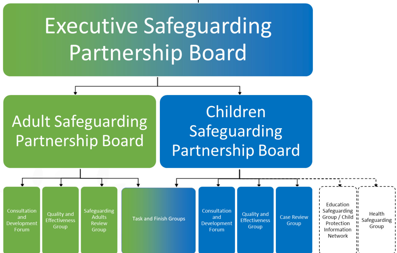
Figure 1: Diagram of Cambridgeshire and Peterborough safeguarding partnership structure

Bringing together adults and children’s safeguarding on a countywide level ensures that safeguarding issues are looked at holistically in a “think family approach” and also provides a forum for transitional arrangement’s to be discussed and agreed